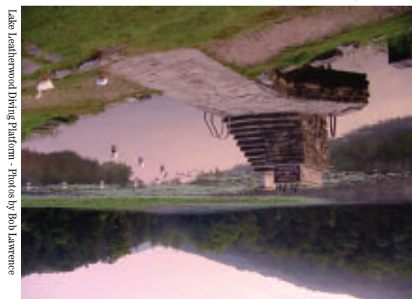
Lake Leatherwood Diving Platform - Photos by Bob Lawrence

M elcome to Lake Leatherwood. This historic 1600-acre city park is a pristine example of Ozark Mountain countryside. Hardwood forests cover steep hills divided by a narrow 85-acre lake that is continuously recharged by cold spring water. At the north end of Lake Leatherwood, a hand-cut limestone dam spills millions of gallons of water into a pool far below where white water curls in eddies beside the red rocks of Iron Spring to form a creek that flows across boulders and rocks on its downhill course through the lower valley. The cut limestone-faced dam, one of America's largest, was built in the 1940s by the Civilian Conservation Corps. Both the dam and the park are listed on the National Register of Historic Places. On the west side of Lake Leatherwood, the land rises past a small marina to broad level land that provides room for picnic areas, a barbeque shelter house, a playground, volleyball, and a WPA-era bathhouse. The hiking and mountain biking trail begins and ends here. Treat yourself right. Spend a day enjoying one of America's largest city parks. Lake Leatherwood gives you a lot to choose from.